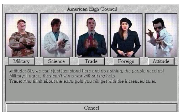
Figure 1: Council of Advisors in Civilization II (Micro-Prose, 1996).

in various domains. We discuss relevant examples below.